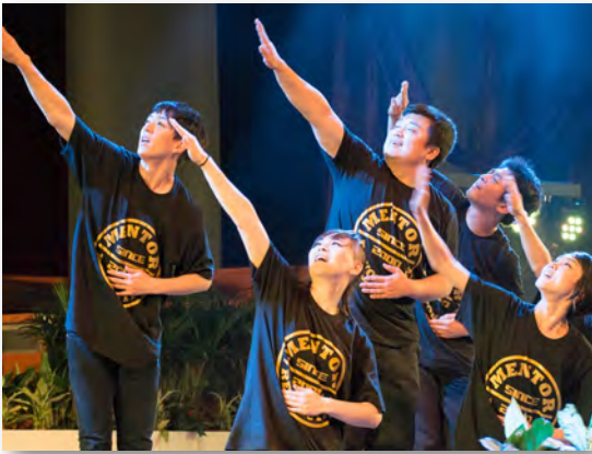
Above: Korean Mentor Revolution in dance; Right: Asia Evangelistic Fellowship team in song.