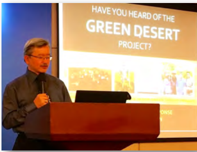
"Can the Desert be Green?"