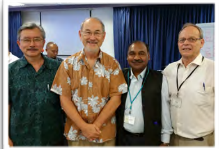
ND with leaders of the Lausanne Asia-Pacific International Students Ministry Forum