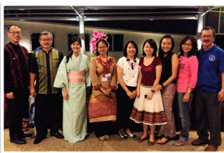
SCGM Staff, Interns and Volunteers at Ethnic Rhythms Concert in July 2015

As Singapore turned 50, we are reminded of our immigrant roots. Scriptures remind us that Jesus was a refugee right from birth and the early Church actively ministered to diaspora communities. We need to do the same. God is the God of the sojourners.