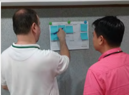
Participants discussing their business models with consultants