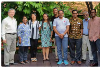
Global Hindu Ministry Network Consultation Organising Committee