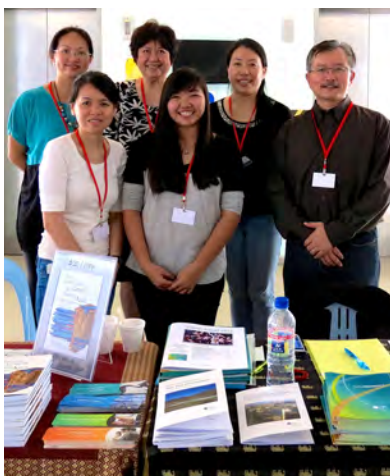
SCGM Staff Team at Annual Lecture