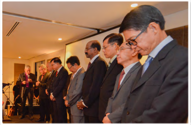
SCGM Council members dedicated themselves to the task of SCGM to mobilise every believer for God's mission.