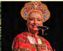
Theology of Mission: Unreached People Groups