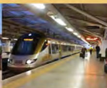
Holistic Mission: From Evangelism to Ecology