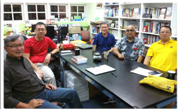
Barker Road Methodist Church supported SCGM in the Fundraising Music Concert in March and explored further partnership in mission strategies together