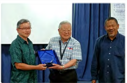
SCGM ND being presented with a token of appreciation by the Global Diaspora Network for hosting the consultation