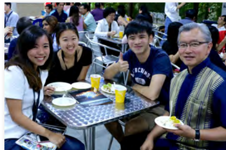
ND with some university students at the Forum

Below: Forum Panelists include the following speakers ...from left: