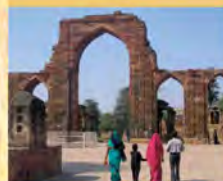
Historical Perspectives: On Transmission of Faith