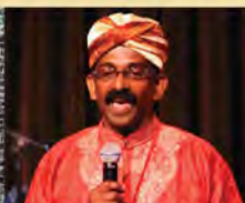
Cultural Anthropology & Contextualisation