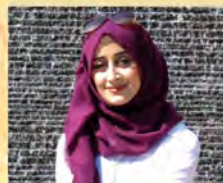
Understanding World Religions