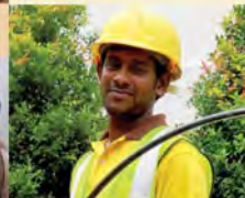
Survey of Bible Doctrine: The Faith of the Church