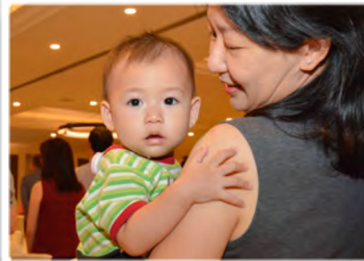
Never too young to get a headstart in mission partnership