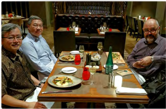
SCGM explored partnership with Biblical Graduate School of Theology and Prinsep Street Presbyterian Church on Urban Missions training