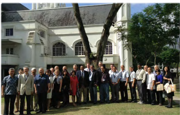
Group Photos of the Global Diaspora Missiology Educators' Consultation held in Singapore in March 2016