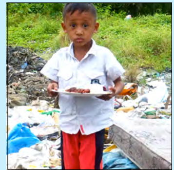
Boy with his lunch in a dumpsite