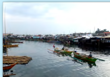
Slum settlement along Las Pinas port