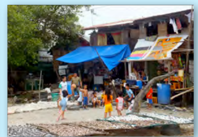
Children play during low tide in riverside village