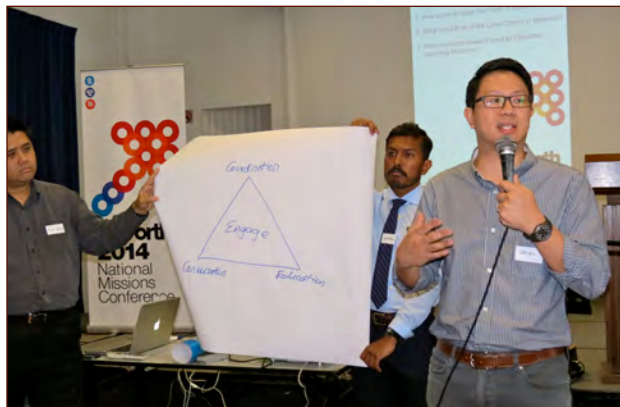
Gen Y missionaries, Youth pastors and younger leaders attended the GoForth Lunch on Dec 4 2013 at St Andrew's Cathedral. They discussed and presented ideas on missions and youth.