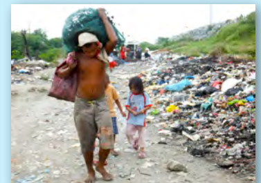
Livelihood for family living in one of Manila's dump sites