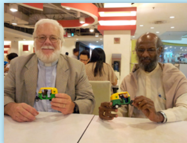
Two Pastors from Canada & Maldives