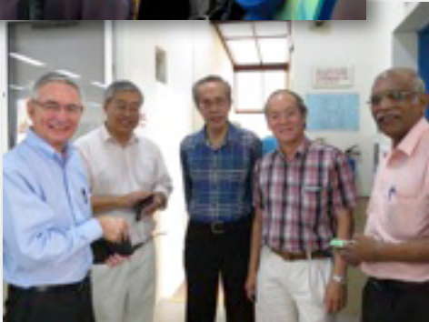
MBF participants at tea break exchanging ideas and name cards...