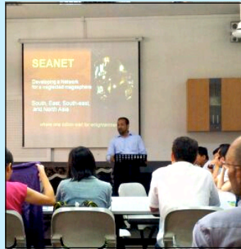
SCGM SEANET Seminar Aug 13

SCGM is pleased to launch a Youth Media Project to encourage youths and young adults to be trained in digital film production in the months of Oct-Nov 2013, to produce Asian mission videos which can be used for GoForth 2014. This project is supported by the Methodist TRAC Board of Mission.