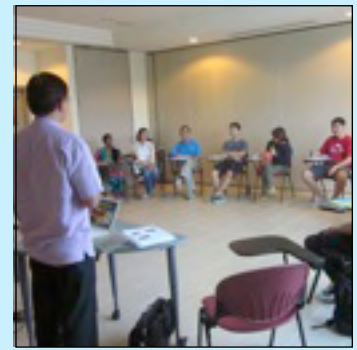
TTC Cert in Missions Studies Jul 13