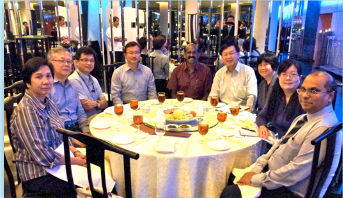
SCGM Executive Council meeting cum food tasting dinner in Jul 13