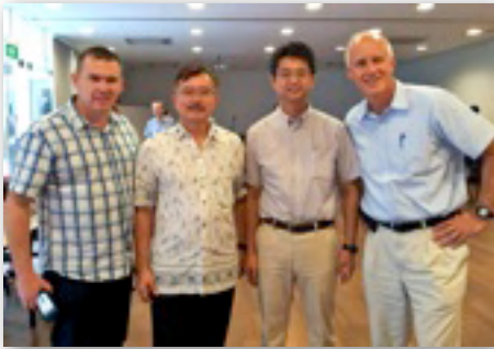
Japanese pastor and missionaries at SCGM Breakfast Sep13