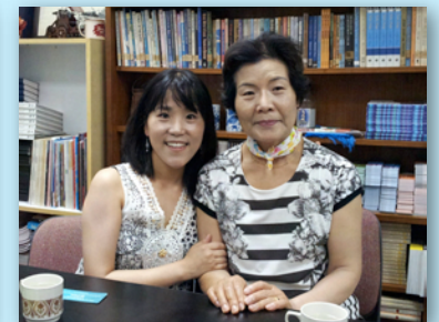
Two visitors from Seoul, Korea