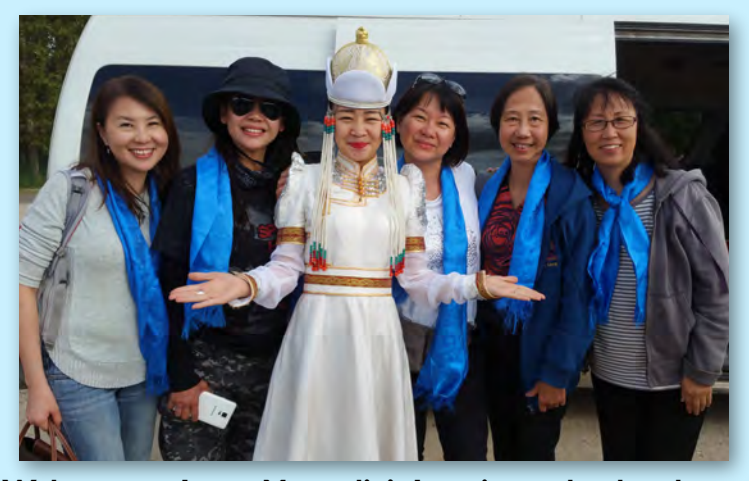
Welcome to Inner Mongolia's Lanqi grassland and stay at a Mongolian ger.