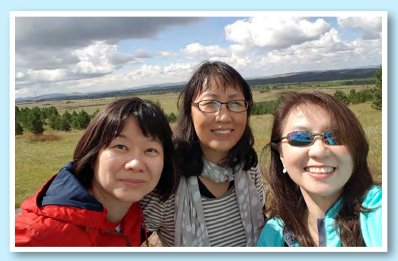
The Singapore team visited Asian Journeys Ltd's Treeplanting base and planted trees at Dabao eco park.