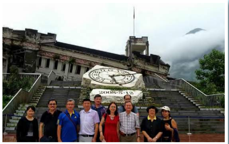
The Singapore team visiting Ying Xiu town near the epicentre of Wenchuan earthquake area

SCGM organised a missional business exploratory trip to Du Jiang Yan city in July 3-6 2016. The team of 8 participants comprised business leaders and including 4 professionals who have had 10-20 years working in China's Suzhou Industrial Park. The team also visited cities and townships which were devastated by the 2008 Wenchuan earthquake including Peng Zhou and YingXiu. The team learnt of the business opportunities in Du Jiang Yan and explored partnerships with some local business leaders and professionals.