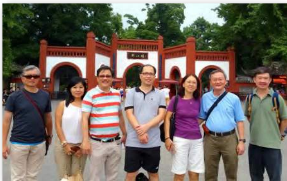
Visit to the famous Du Jiang Yan water works