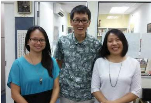
Visit by Mongolian missions leader studying at East Asia School of Theology