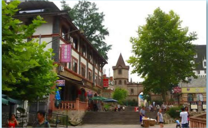
Visit to an ancient French town Bailu near Peng Zhou