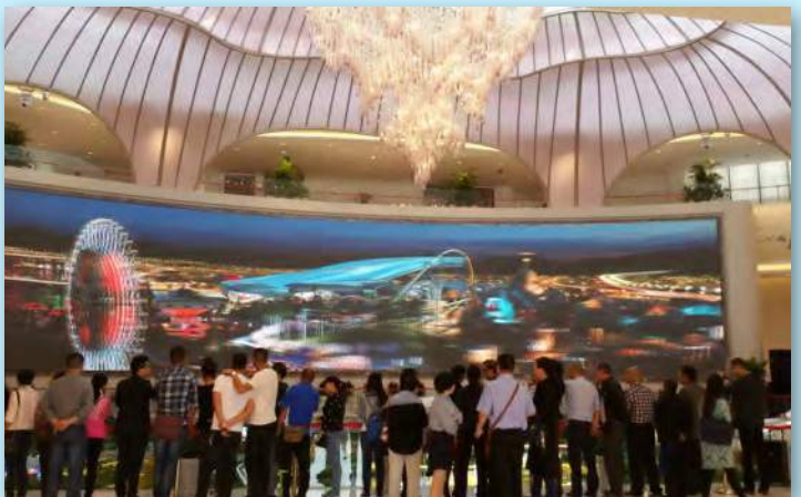
Du Jiang Yan will be home to Wanda's large theme park