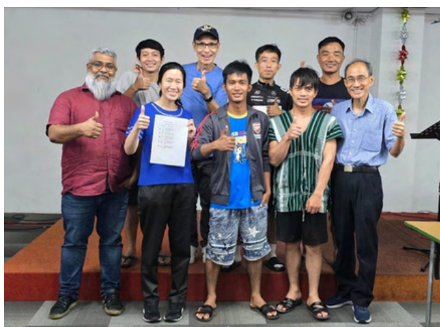
LMP class participants of 2024

Additionally, participants were required to commit to 40 hours of engagement with people of other cultures/religions, to understand an aspect of their way of life. Participants were also expected to design a contextualised Christian practice and write a reflection paper on their whole learning experience.