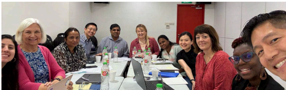
ND with global leaders from Lausanne in Singapore