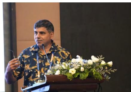
PHOTOS: COALA in Bangkok, 2024