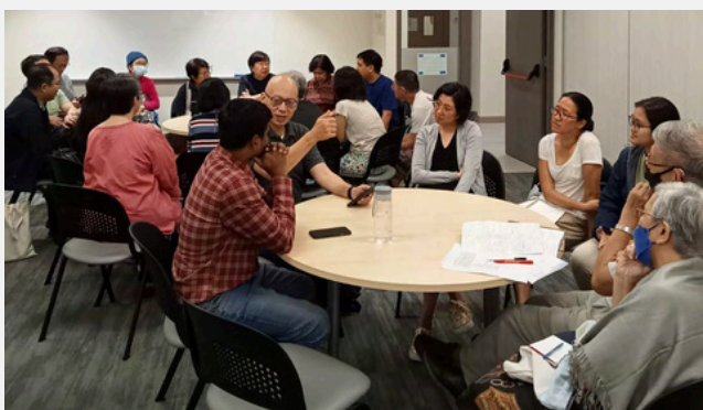
Project-based group discussions at MC+

The 2 nd half of the year featured regular Missions Conversation seminars on topics related to innovations in missions today, including reaching the next generation, digital missions and mobilising the senior age group for missions (read full report on page 10).