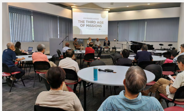
Missions Conversation in October 2024